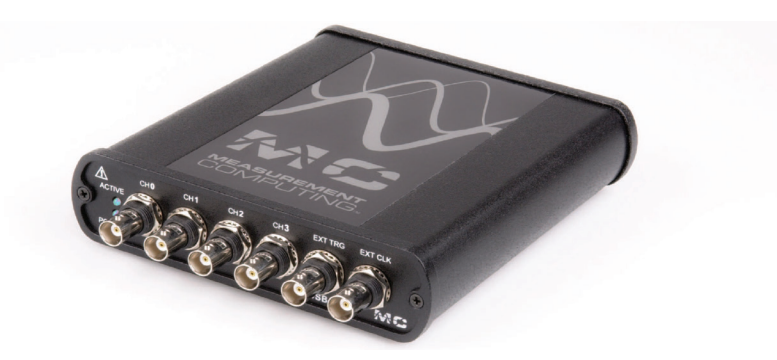
The USB-1602HS and USB-1604HS Series provides high-speed simultaneous sampling. Signals connect to BNC (front) and SCSI (rear) connectors. The USB-1604HS-2AO is shown here.

The USB-1602HS/USB-1602HS-2AO has two analog inputs and the USB-1604HS/USB-1604HS-2AO has four. Each input has a dedicated 16-bit ADC that provides true simultaneous sampling per channel.